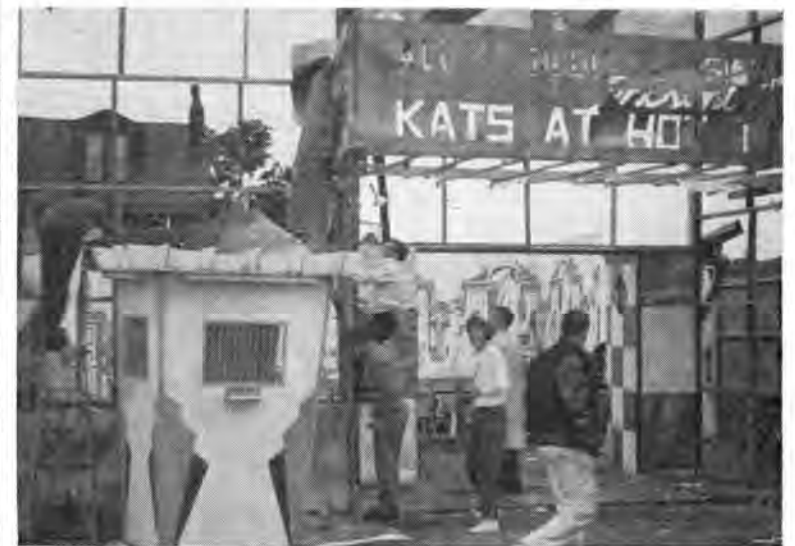
The outdoor theatre after the storm. Hard work put the structure back together again, however, and the Chapter still took third prize.

Psi is looking forward to first place in the Carnival next year.