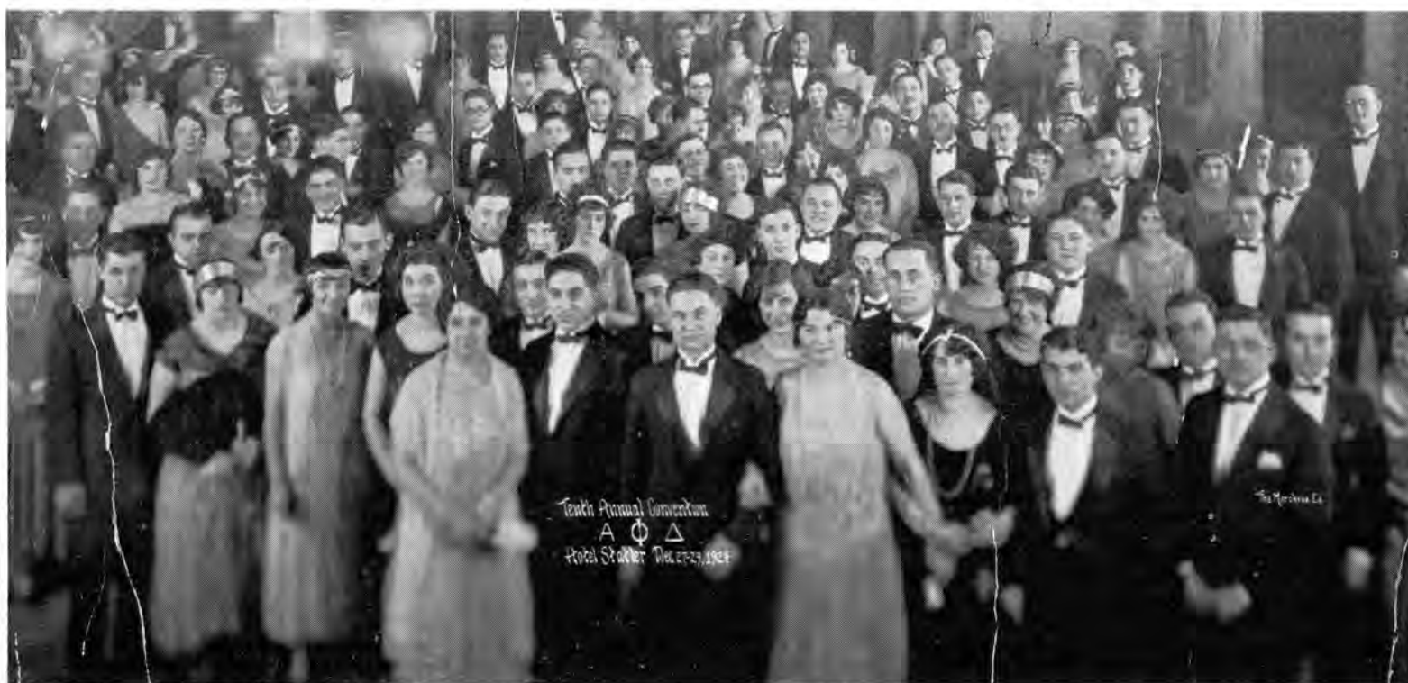
The small creases visible in the above photo is not our printer's fault. It's just the photo of the 1924 Convention showing its age. Actually, it looks better than the original. Which is all to say that regardless of how poor a condition you may think your old Convention photo is in, we can still do pretty well with it. So please search your attic; we have coverage for the 1924, 1925, 1927, 1931, 1933, 1934 and 1938 Conventions but need the rest.

The 1924 National Convention was held at the Statler Hotel in Cleveland, Ohio, December 27th, 28th and 29th. Officially, it was the Seventh National Convention.