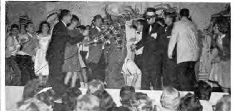
Psi performers at their outdoor theatre which they built for Duquesne University's 1960 Carnival Festival

Duquesne University's 1960 Carnival Festival was the scene of another first for Alpha Phi Delta, Psi Chapter.